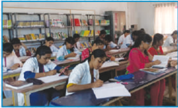
Bio Chemistry Lab